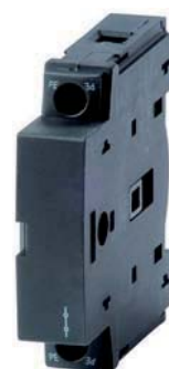
Protective earth module