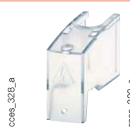
SIRCO M 1P