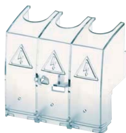
SIRCO MV 3P