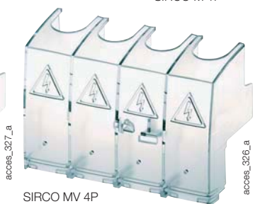
SIRCO MV 4P