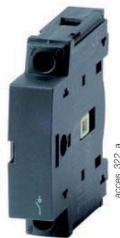
4 th pole