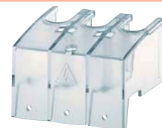
SIRCO M 3P